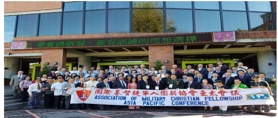
2016 EA Conf(TAIWAN)