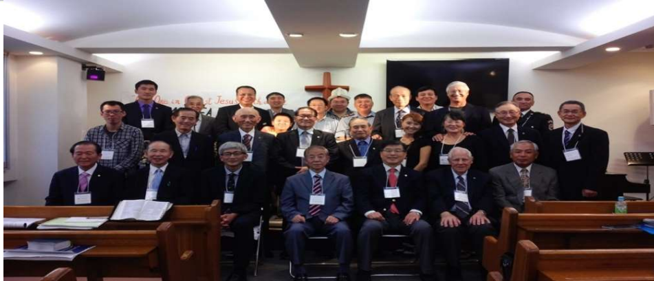
2015 EA IA(JAPAN)