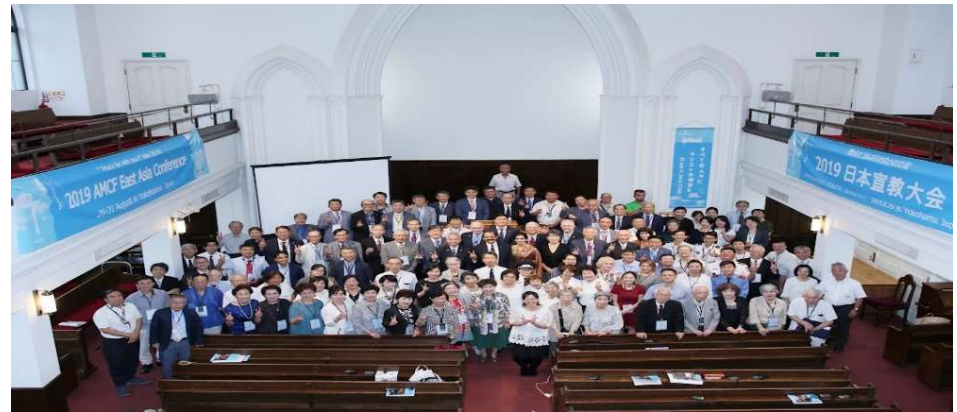
2019 EA Conf (JANPAN)