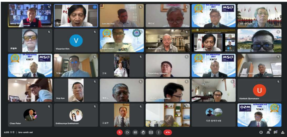
2021 EA IA (TAIWAN/Online)