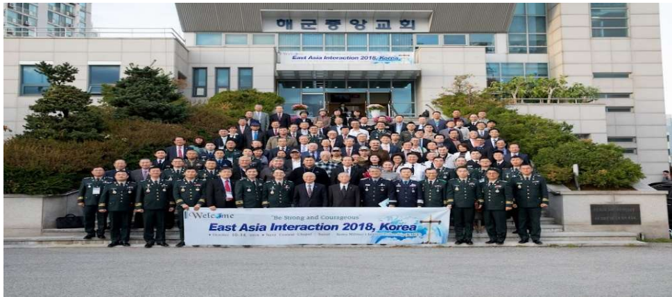
2018 EA IA ( KOR )