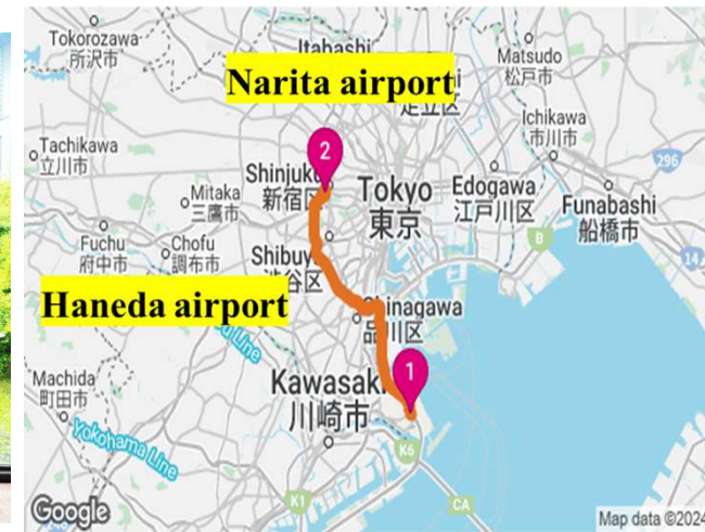
2025 ECA Interaction Tokyo